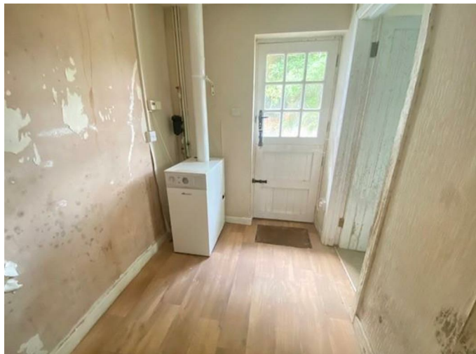
Housing the Worcester oil boiler and external stable door. Door to shower room.