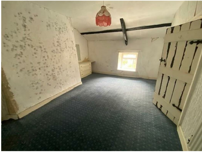
BEDROOM 2 16'0" x 9'10" max (4.89m x 3.00m max)