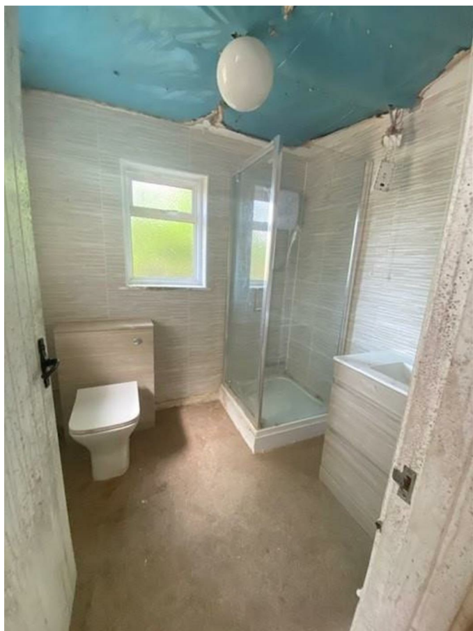
Vanity unit, WC and shower enclosure. radiator , shaver point and window to rear.