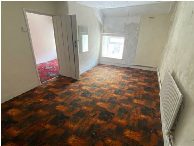
Radiator and window to front.