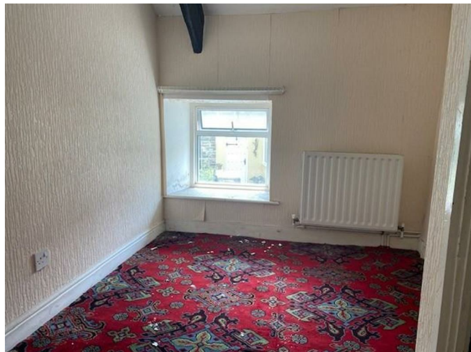
Landing with window to front elevation, radiator and doors off to.....