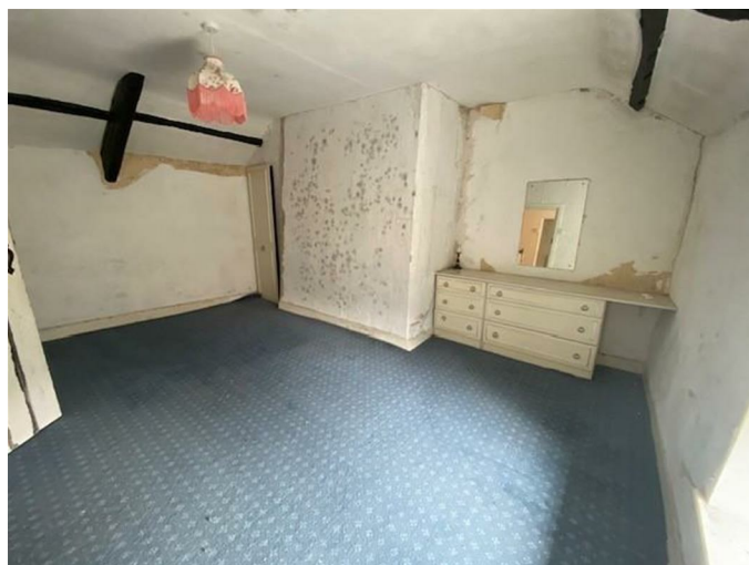
Window to front, radiator, dressing table and built in storage cupboard.